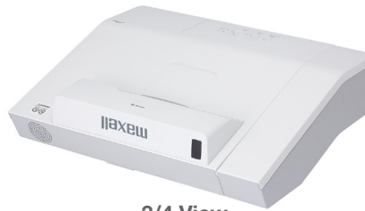
3/4 View (with cable cover)

resolution, the MC-AW3506 provides the perfect compatible solution. It also features a high contrast ratio, long lamp life, cloning function enabling you to copy settings data from one projector to others of the same model, and is wireless presentation ready. Plus, embedded networking gives you the ability to manage and control multiple projectors over your LAN (scheduling of events, centralized reporting, image transfer, and email alerts). Best of all, the high performance MC-AW3506 is exceptionally reliable and offers a very low cost of ownership.