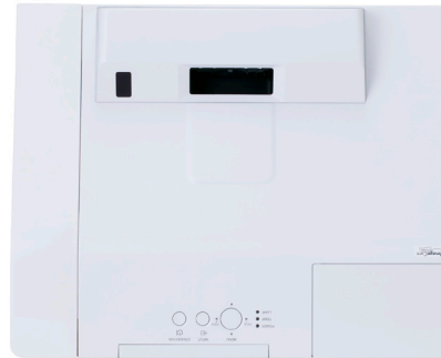
Top View (with cable cover)