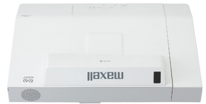
Front View (with cable cover)